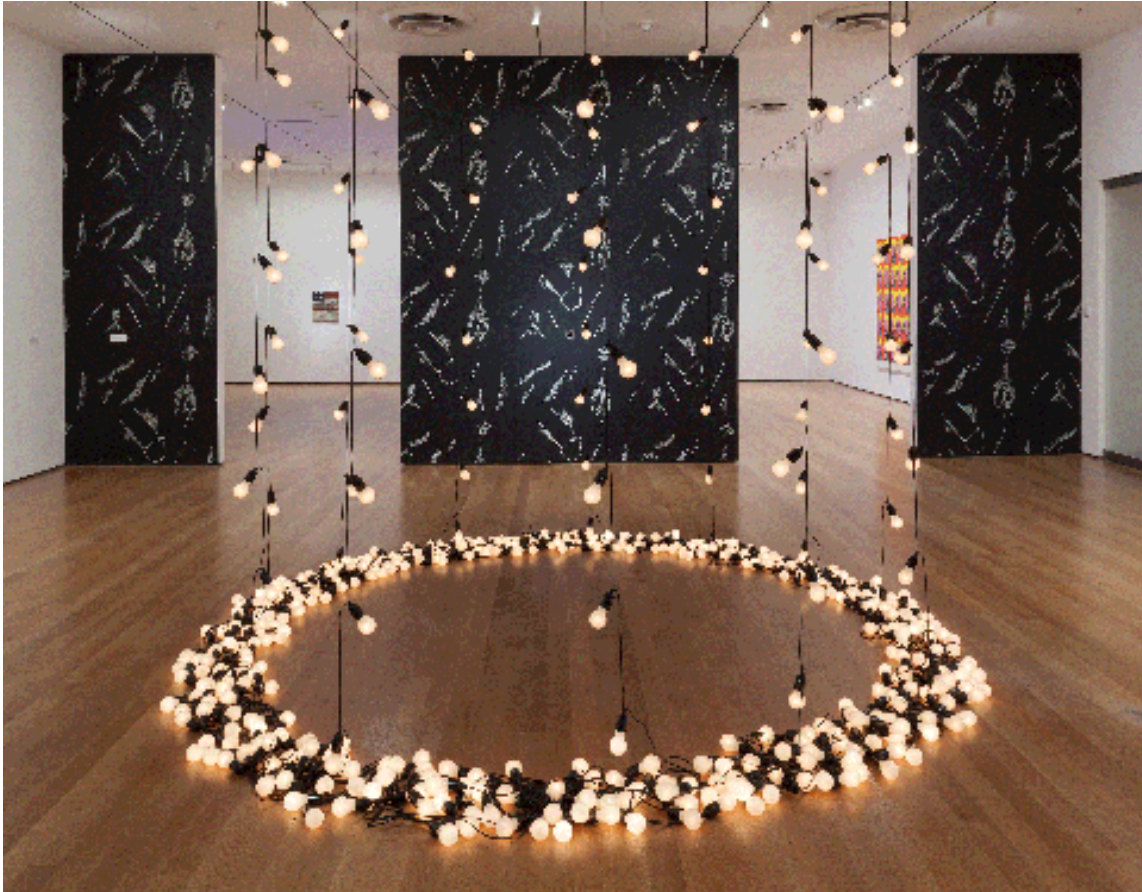
Installation view of Sturtevant: Double Trouble, The Museum of Modern Art, November 9, 2014–February 22, 2015. All works by Sturtevant © Estate Sturtevant, Paris

these regards, she may have been influential. It is an indication of how narrow her art is, however, that it opens up to nothing more. Sturtevant may have anticipated or even marked the culture that followed her, but her descendants have developed little over time. Her work, like that of all minor artists, has inspired no complex growth. At bottom, her mantra can be summed up neatly, without the need for elaboration, either by her or by anyone else. Repetition, anyway, is easier than enlargement. If she arrived early, she did so with a stifled contribution, which is not itself worthy of admiration.