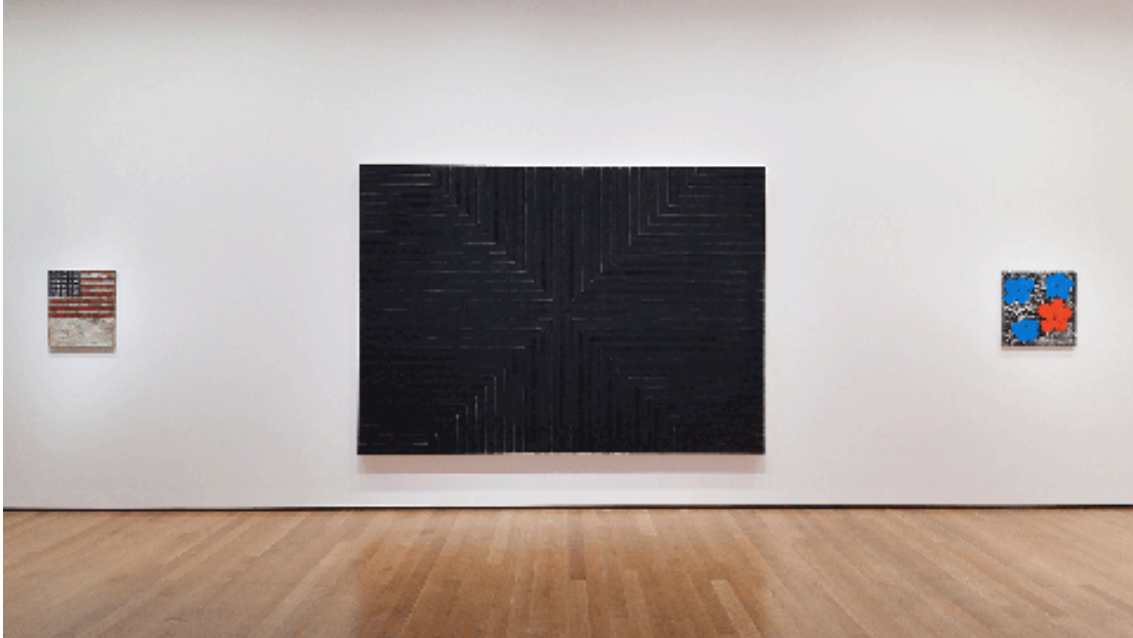
Installation view of Sturtevant: Double Trouble, The Museum of Modern Art, November 9, 2014–February 22, 2015. All works by Sturtevant © Estate Sturtevant, Paris

by Pac Pobric | December 18th, 2014 | Los Angeles Review of Books