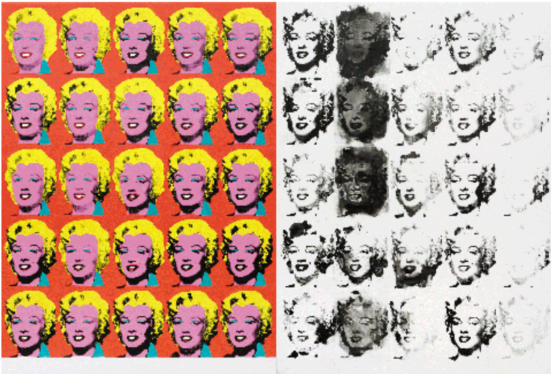
Sturtevant. Warhol Diptych. 1973/2004. Synthetic polymer screenprint and acrylic on canvas. 6' 11 7/8" × 10' 6 3/4" (213 × 322 cm). Pinault Collection.

originality that does not breathe. This is her postmodern provincialism: that her idea does not expand, that it is a town with a population of one. Her art does obvious, monotonous work. It draws repeatedly from the same wellspring without recognizing that the result is an intellectual drought. "Specifics are totally [sic] crippling and of no concern to me," she wrote in a letter to the dealer Virginia Dwan. What mattered was what Sturtevant called "the total structure" of art, the postmodern condition that made invention impossible. Culture was trapped in a single region and the only thing left to do was illustrate the point through ruthless repetition. Whether she reiterates Warhol ("Warhol Diptych," 1973/2004) or Duchamp ("Duchamp Fresh Widow," 1992/2012), the point is the same: that the province of culture is closed to expansion.