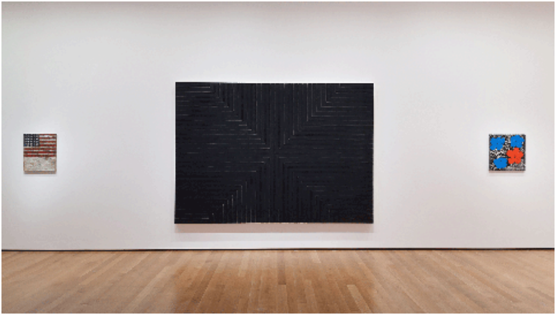
Installation view of Sturtevant: Double Trouble, The Museum of Modern Art, November 9, 2014–February 22, 2015. All works by Sturtevant © Estate Sturtevant, Paris

by Pac Pobric | December 18th, 2014 | Los Angeles Review of Books