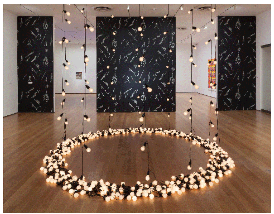
Installation view of Sturtevant: Double Trouble, The Museum of Modern Art, November 9, 2014–February 22, 2015. All works by Sturtevant © Estate Sturtevant, Paris

these regards, she may have been influential. It is an indication of how narrow her art is, however, that it opens up to nothing more. Sturtevant may have anticipated or even marked the culture that followed her, but her descendants have developed little over time. Her work, like that of all minor artists, has inspired no complex growth. At bottom, her mantra can be summed up neatly, without the need for elaboration, either by her or by anyone else. Repetition, anyway, is easier than enlargement. If she arrived early, she did so with a stifled contribution, which is not itself worthy of admiration.