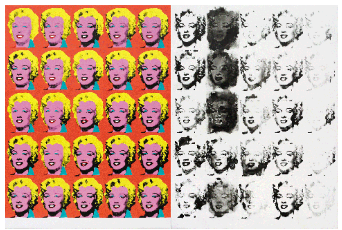
Sturtevant. Warhol Diptych. 1973/2004. Synthetic polymer screenprint and acrylic on canvas. 6' 11 7/8" × 10' 6 3/4" (213 × 322 cm). Pinault Collection. Photo: Axel Schneider, Frankfurt am Main. © Estate Sturtevant, Paris

originality that does not breathe. This is her postmodern provincialism: that her idea does not expand, that it is a town with a population of one. Her art does obvious, monotonous work. It draws repeatedly from the same wellspring without recognizing that the result is an intellectual drought. "Specifics are totaly [sic] crippling and of no concern to me," she wrote in a letter to the dealer Virginia Dwan. What mattered was what Sturtevant called "the total structure" of art, the postmodern condition that made invention impossible. Culture was trapped in a single region and the only thing left to do was illustrate the point through ruthless repetition. Whether she reiterates Warhol ("Warhol Diptych," 1973/2004) or Duchamp ("Duchamp Fresh Widow," 1992/2012), the point is the same: that the province of culture is closed to expansion.